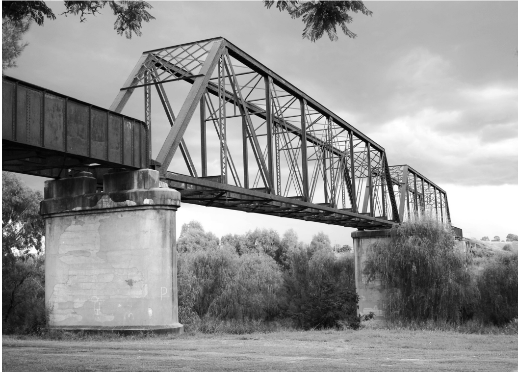
Old Railway Bridge-Manilla History