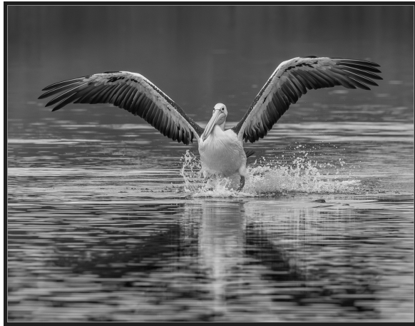
Wings over Water Merit Kevin Weir