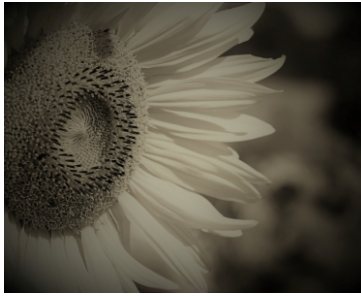
Sunflower Accepted Leona Broekman