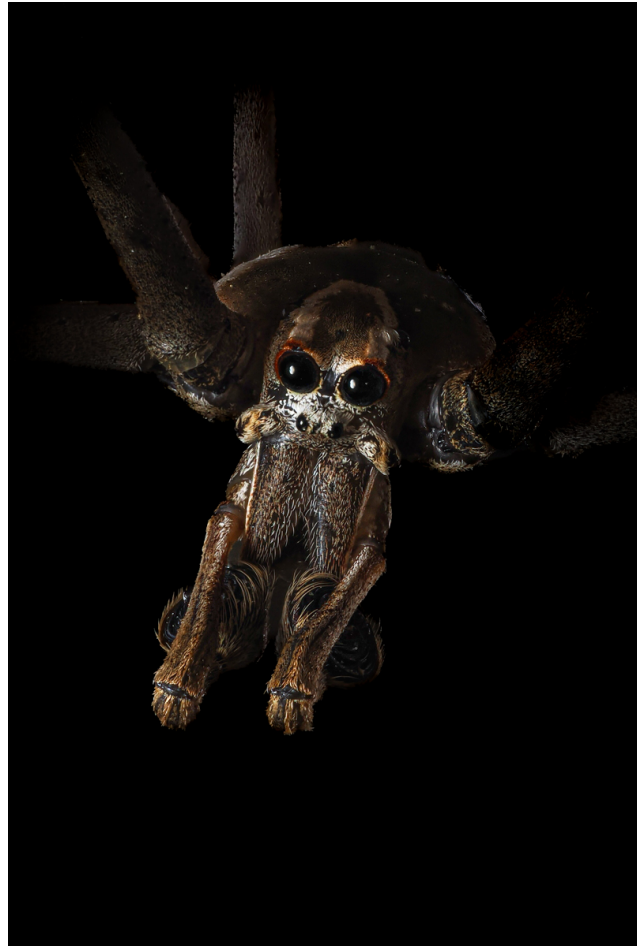
Welcome to your nightmare