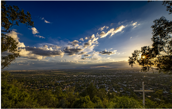
Big Vista Merit Tony Green