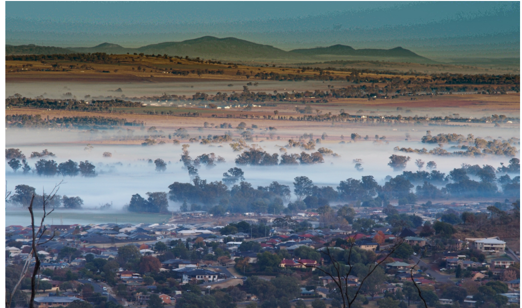
Mist over Tamworth