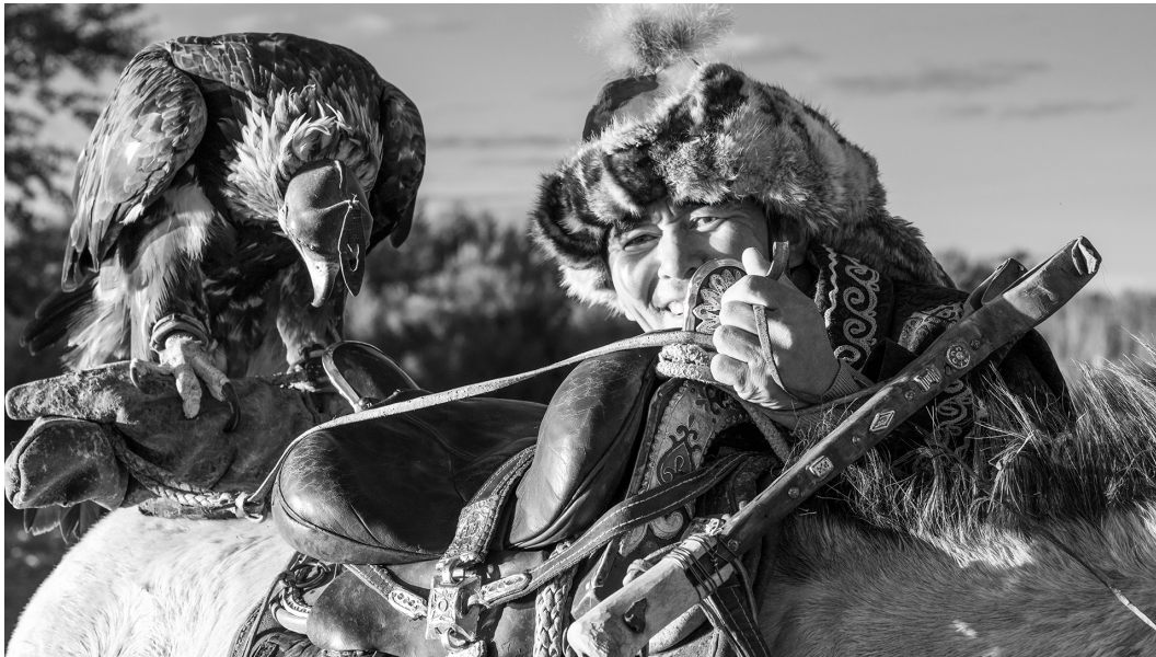
Lests Go Hunting