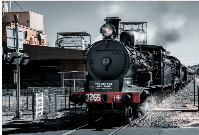
Fielder Railway Crossing Tamworth Merit Neville Ritchie