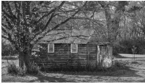
Bendemeer Autumn Accepted Lyn Craggs