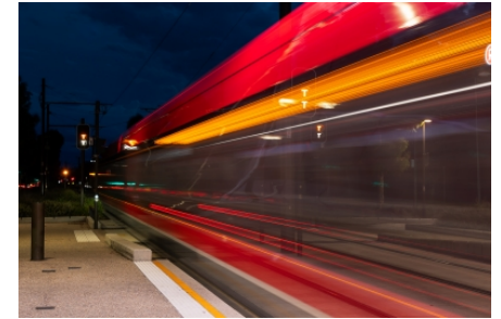
Missed It By That Much Accepted Lyn Craggs