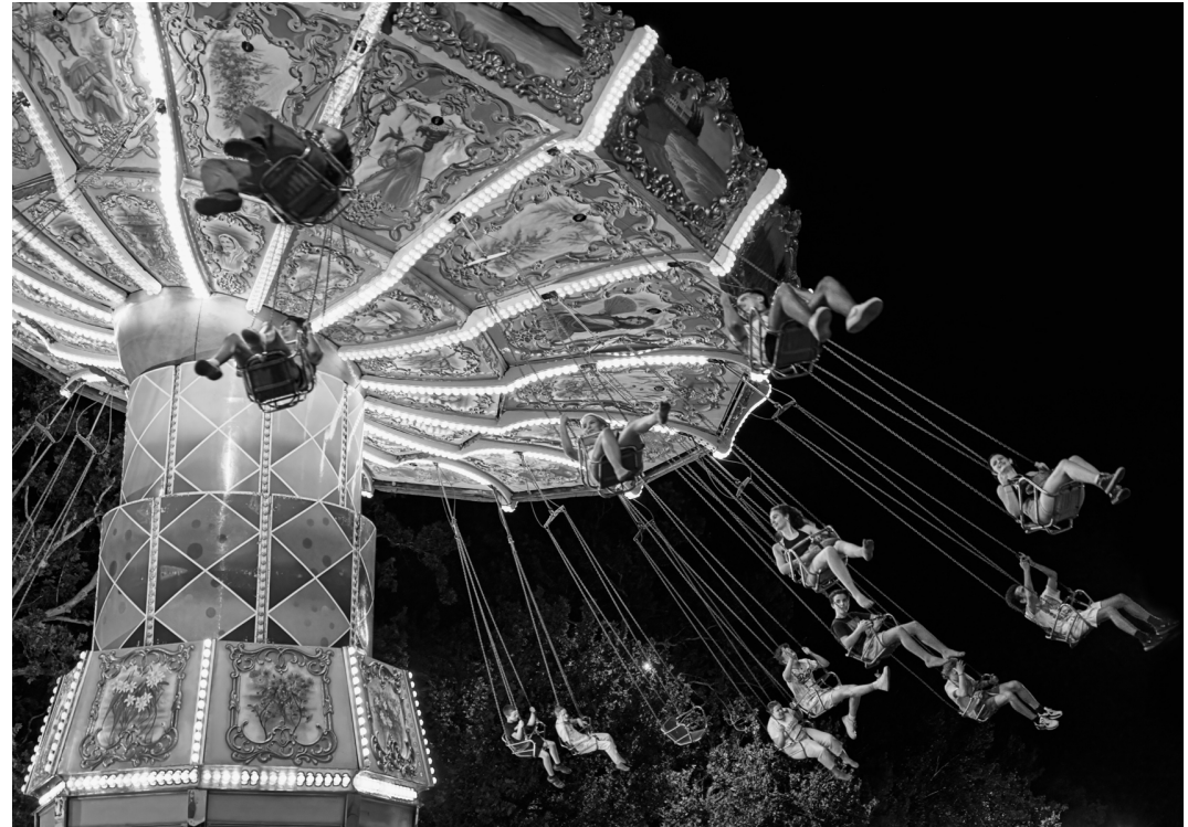
Under the Rotunda