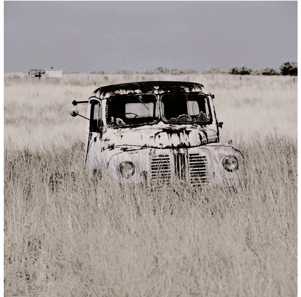
Rusty old truck