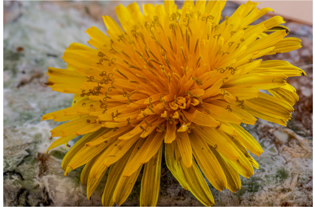
Beautiful Weed Third Place Kaylene Grills